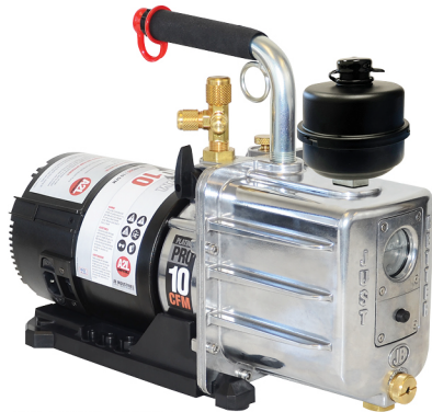
DV-285DC, 10 CFM DV-240DC, 8 CFM