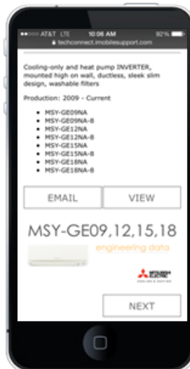
View (Wiring schematics, Hot Pages, etc.)