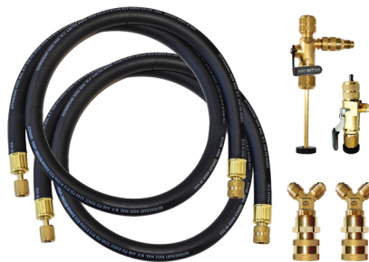
VL-200 ACCELERATOR Rapid Evacuation Kit