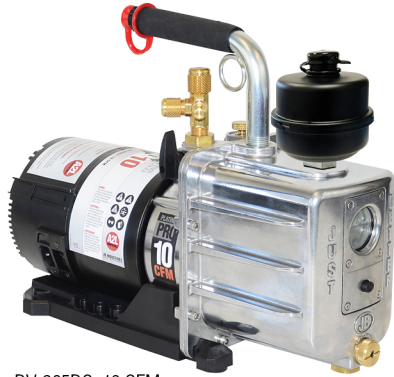
DV-285DC, 10 CFM DV-240DC, 8 CFM