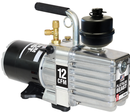
DV-340N PLATINUM BEAST 12 CFM Vacuum Pump