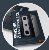
Updated consumer product literature