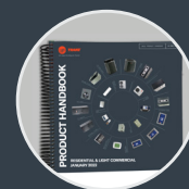
Updated Product Handbook