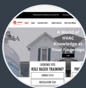
Training and E-learning courses

Throughout 2022, resources will be made available to provide education on the regulatory changes; awareness of product phase in/out timelines; and updated consumer product literature.