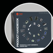
Updated Product Handbook