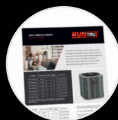
Updated consumer product literature