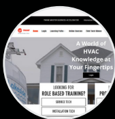
Training and E-learning courses

Throughout 2022, resources will be made available to provide education on the regulatory changes; awareness of product phase in/out timelines; and updated consumer product literature.