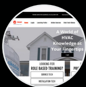
Training and E-learning courses

Throughout 2022, resources will be made available to provide education on the regulatory changes; awareness of product phase in/out timelines; and updated consumer product literature.