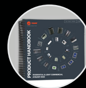
Updated Product Handbook