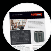
Updated consumer product literature