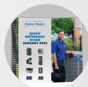
Updated Product Handbook