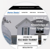
Training and E-learning courses

Throughout 2022, resources will be made available to provide education on the regulatory changes; awareness of product phase in/out timelines; and updated consumer product literature.