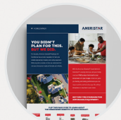
Updated consumer product literature