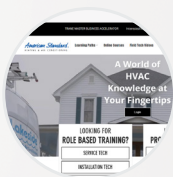
Training and E-learning courses

Throughout 2022, resources will be made available to provide education on the regulatory changes; awareness of product phase in/out timelines; and updated consumer product literature.