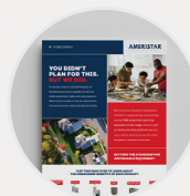
Updated consumer product literature