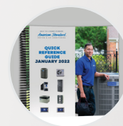
Updated Product Handbook